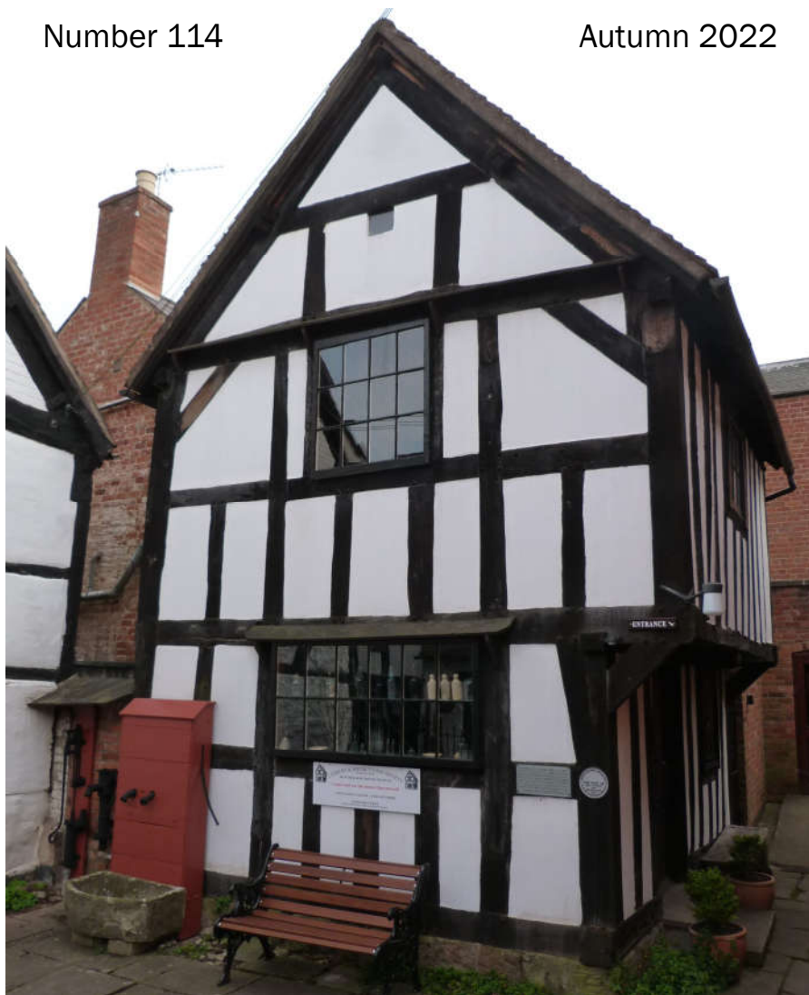
Butcher Row House Museum

Ladbury & District Civic Society “Looking After Ledbury...”