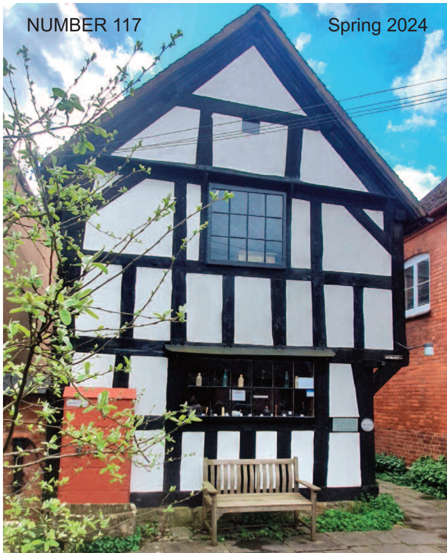
Butcher Row House Museum